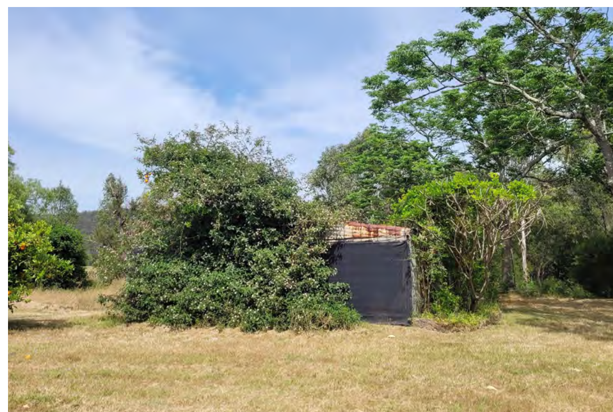
Invasive weed species to be removed