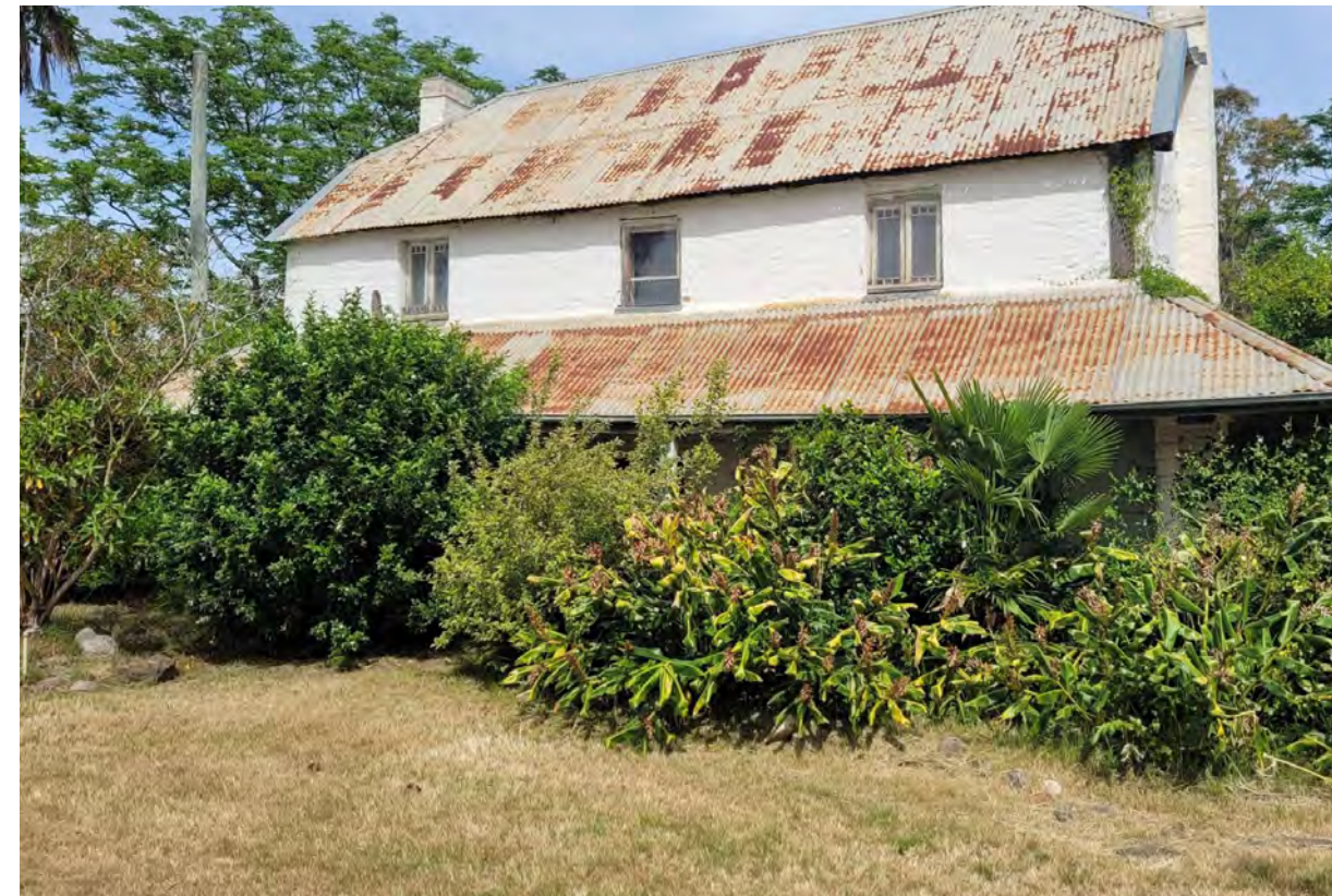
Invasive species to be removed and shrubs to be trimmed