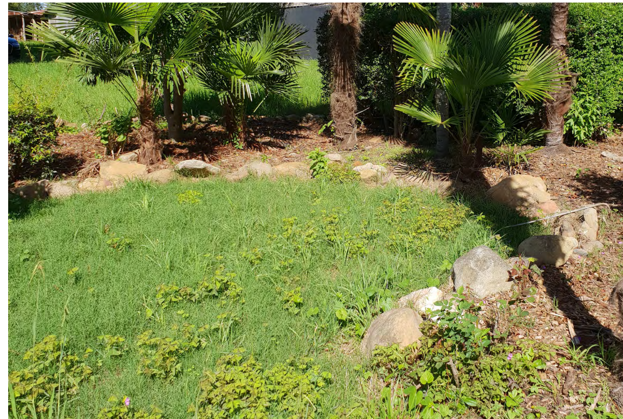
Lawn in need of mowing and weeding