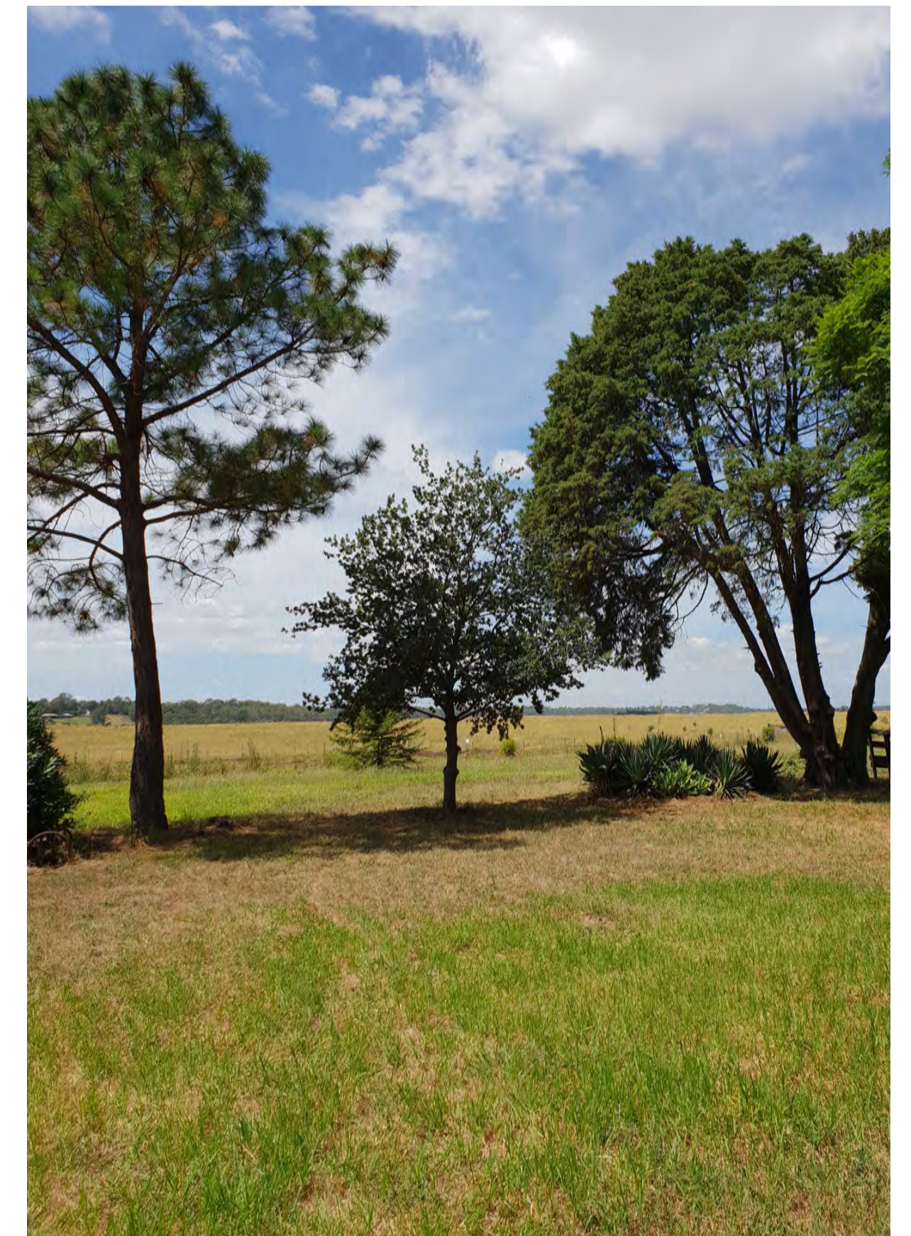
Grass clear of weeds and trimmed