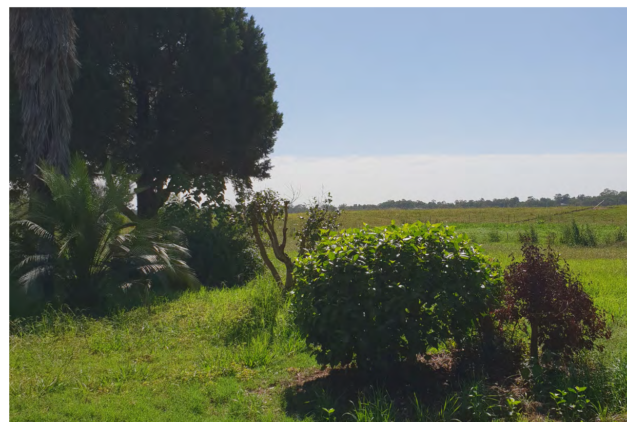
Grass to be mowed and weeded