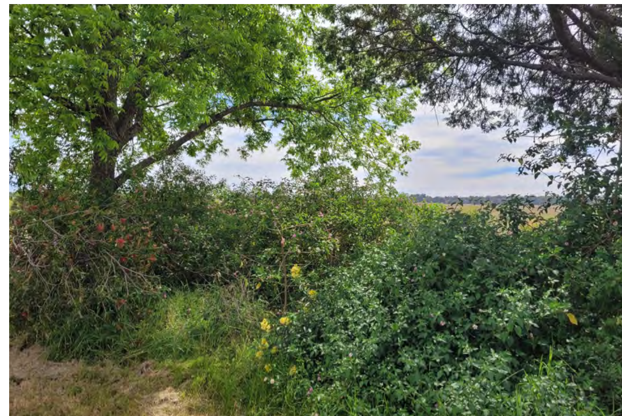
Invasive weed species to be removed