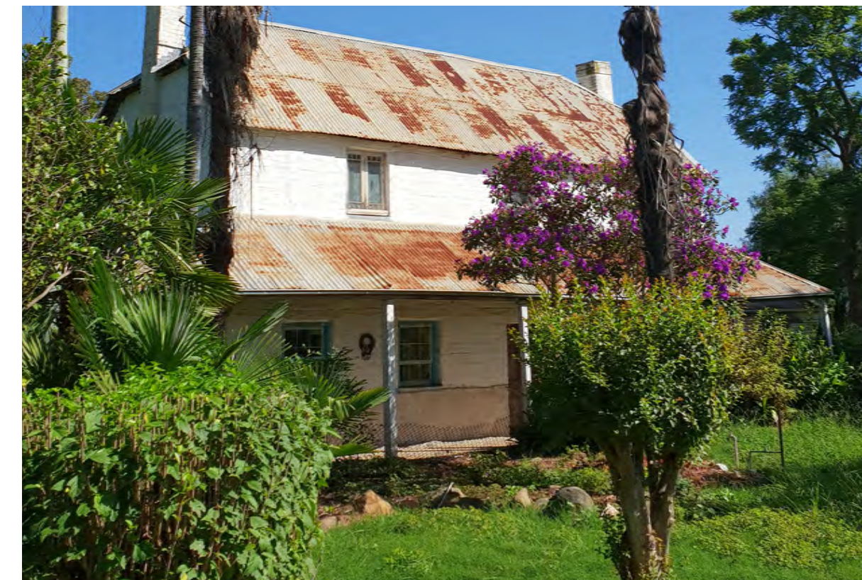
Gardens free from invasive weed species