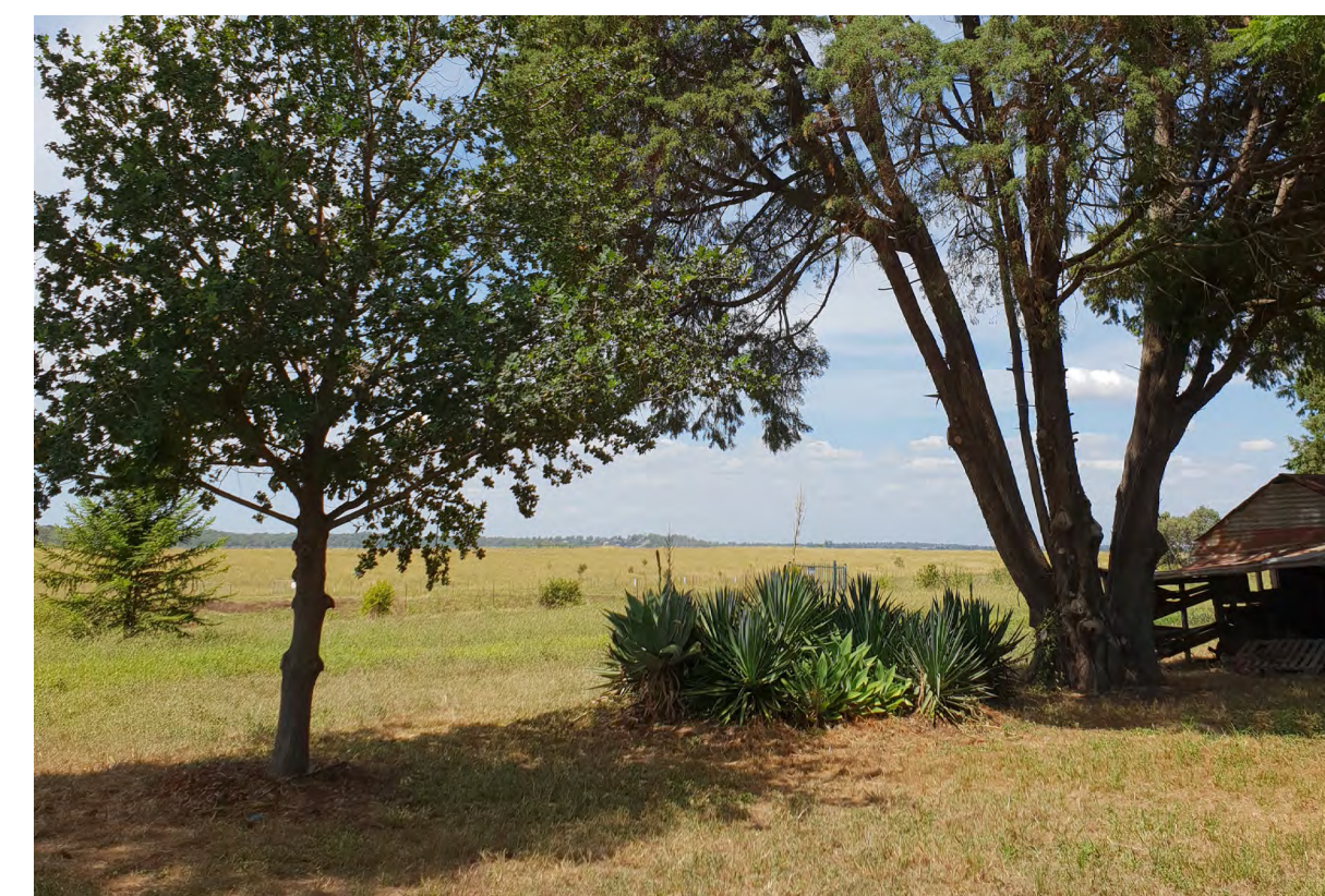
Grass clear of weeds and trimmed