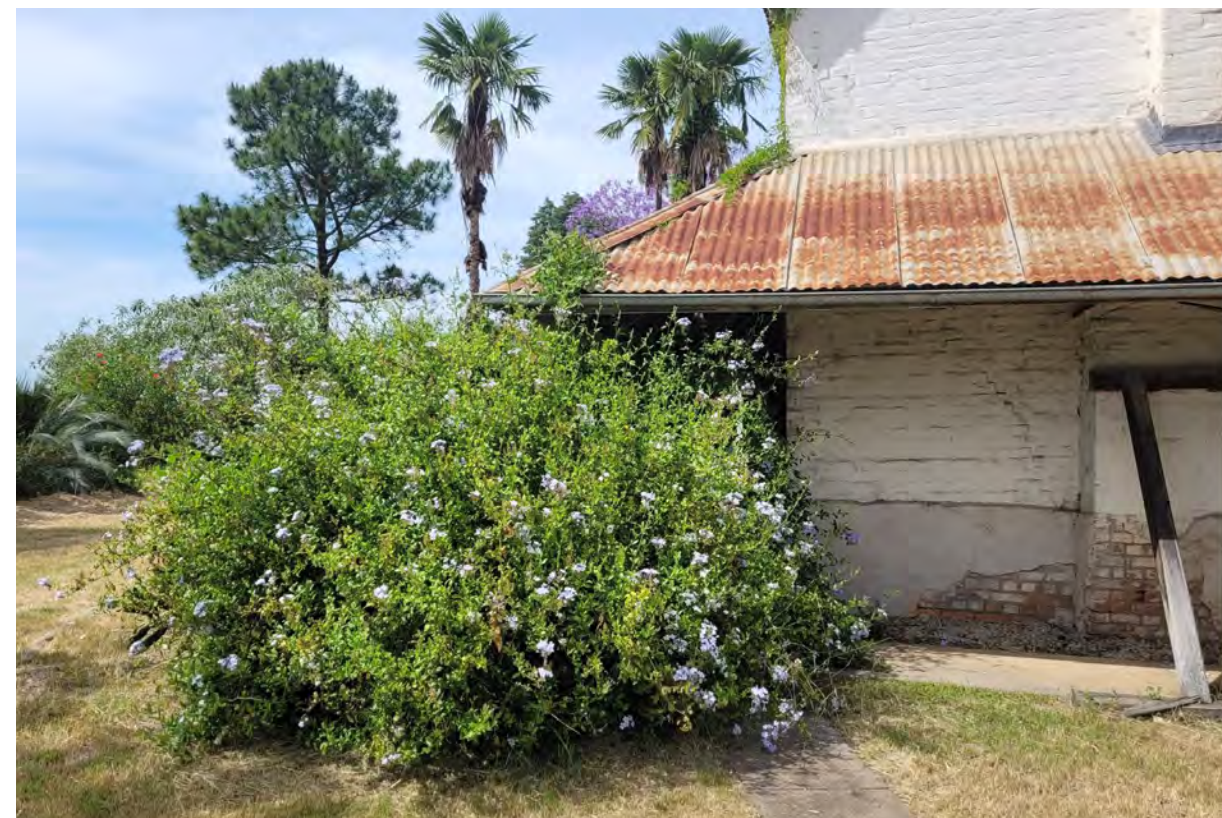
Invasive weed species to be removed