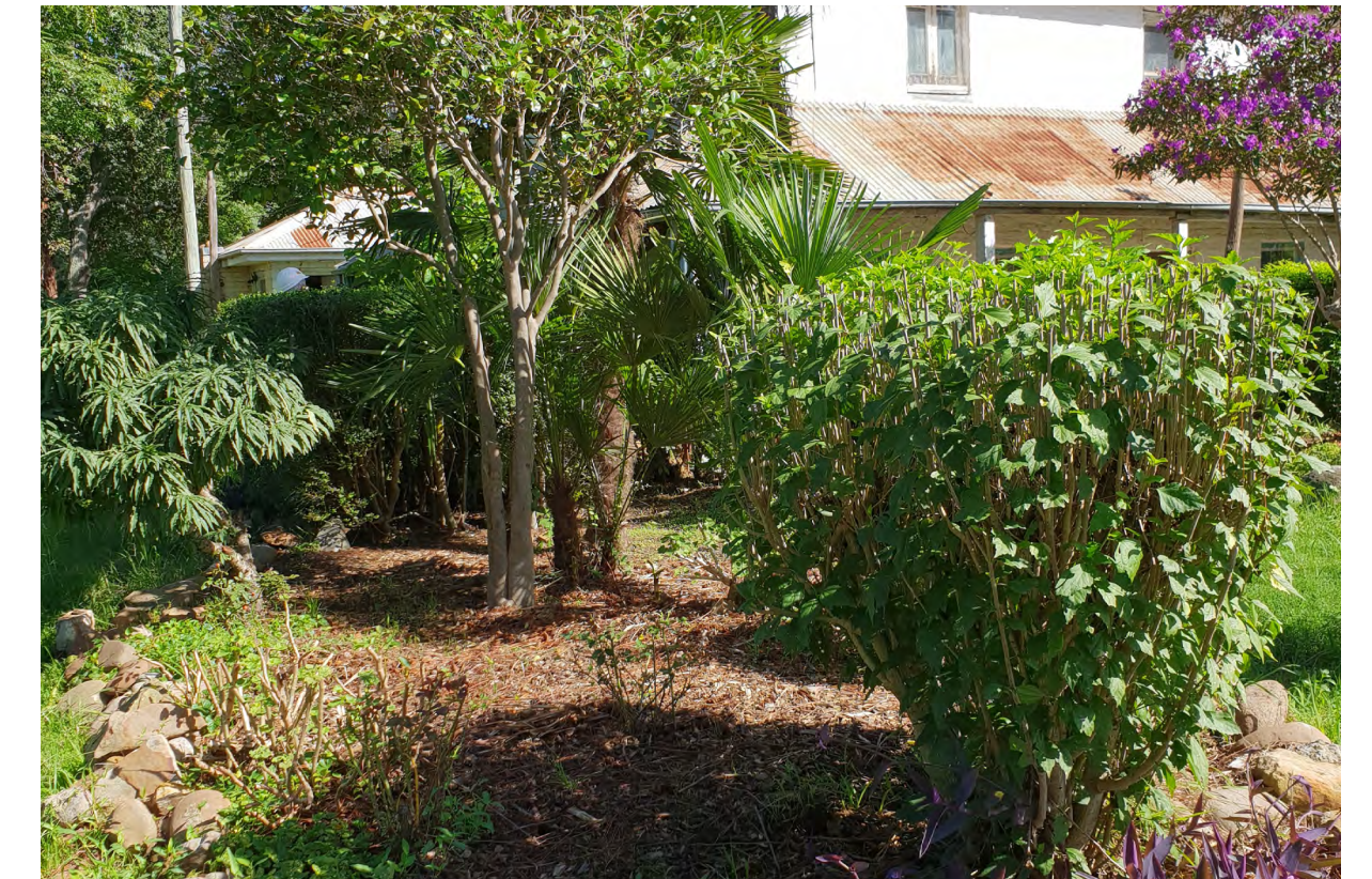
Shrubs clipped to size